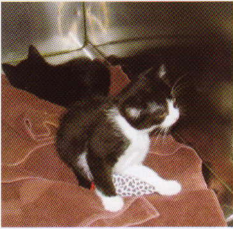
Rescued "Dumpster Kittens".

voted to send a sizable donation to one of the organizations rescuing and placing many of the animals that were abandoned.