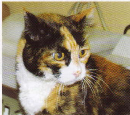
A recovering calico.

After 45 years of working with pets and people, I think I've seen about every scenario possible.